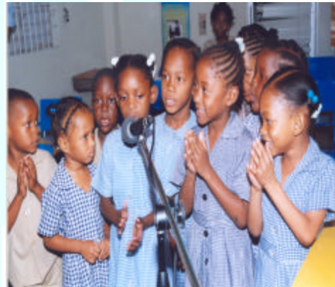
Students from VOUCH/Sylvia Foote Basic School in action.

Nine member agencies received grants in excess of $26 million under the USAID's Uplifting Adolescent Project, managed by People's Action for Community Transformation (PACT). Their programmes have had direct impact on more than 5,000 youngsters.